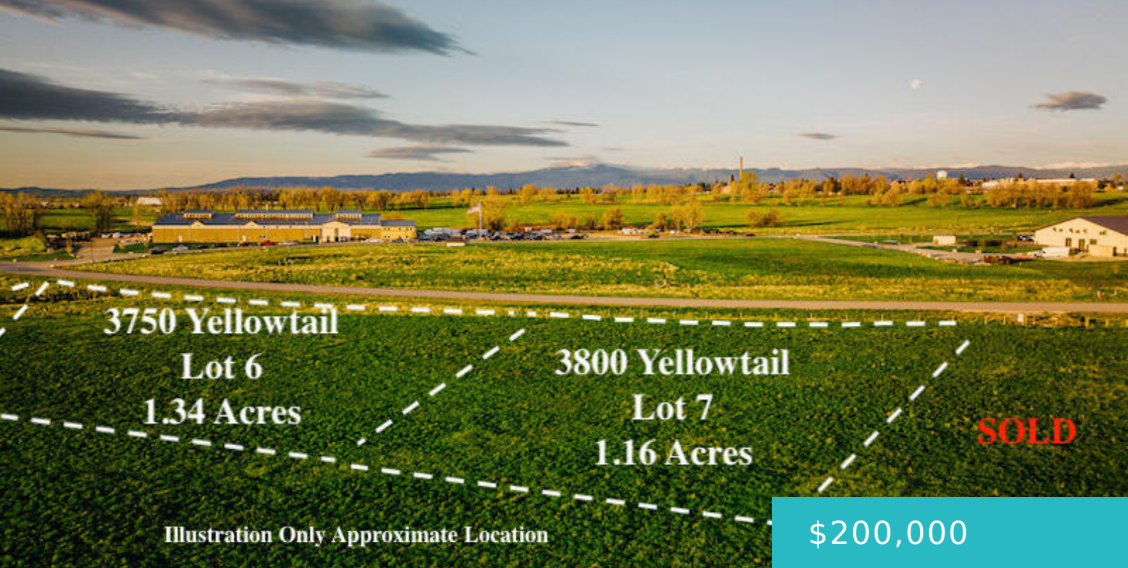
Illustration Only Approximate Location