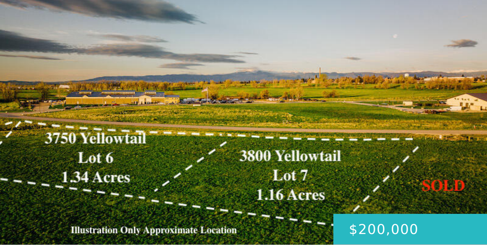
Illustration Only Approximate Location